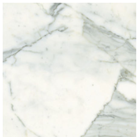
30" x 30" USG3030172 STATUARIETTO honed USP3030172 STATUARIETTO polished