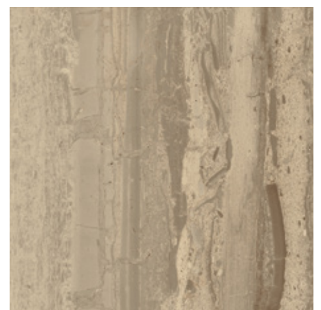
30" x 30" USG3030197 TRAVERTINO CHIARO honed USP3030197 TRAVERTINO CHIARO polished