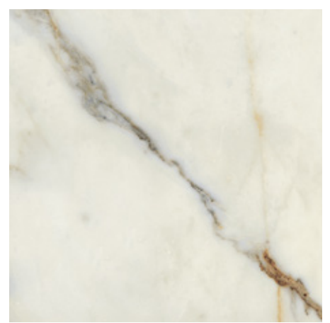
30" x 30" USG3030196 CALACATTA ORO honed USP3030196 CALACATTA ORO polished