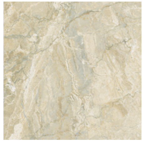
30" x 30" USG3030171 CREMINO honed USP3030171 CREMINO polished