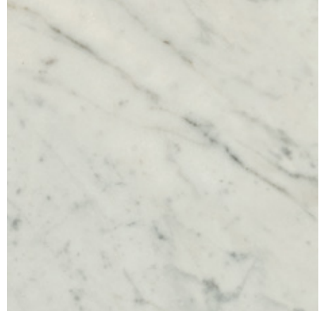
30" x 30" USG3030195 BIANCO CARRARA honed USP3030195 BIANCO CARRARA polished