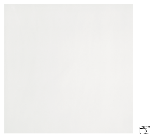
30" x 30"